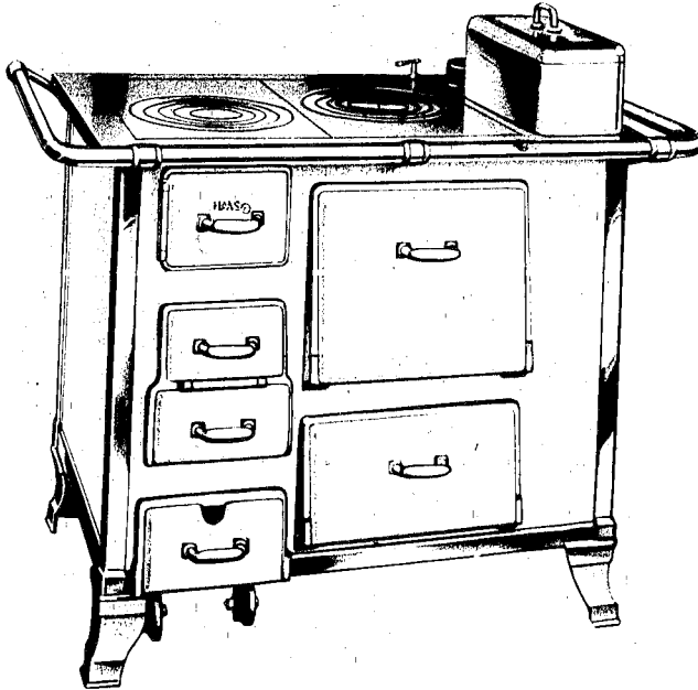
No. 10.86T — 10.92T (for description see overleaf.)