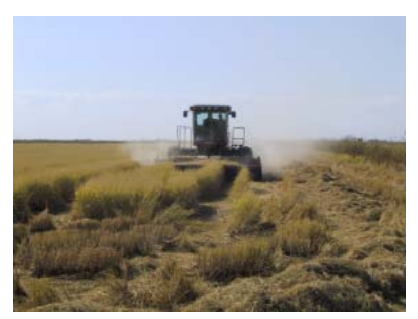
Figure 4-3. Rotary swather cutting stripper header rice straw.

The following Figure 4-3 shows a self-propelled rotary swather cutting stripper header harvested rice straw. After rice harvest, the swather can also cut the remaining stubble by a conventional header harvester to maximize the volume of straw per acre collected. Swathing rice straw is expensive, approximately $10 per acre or $5/BDT for stripper header straw.