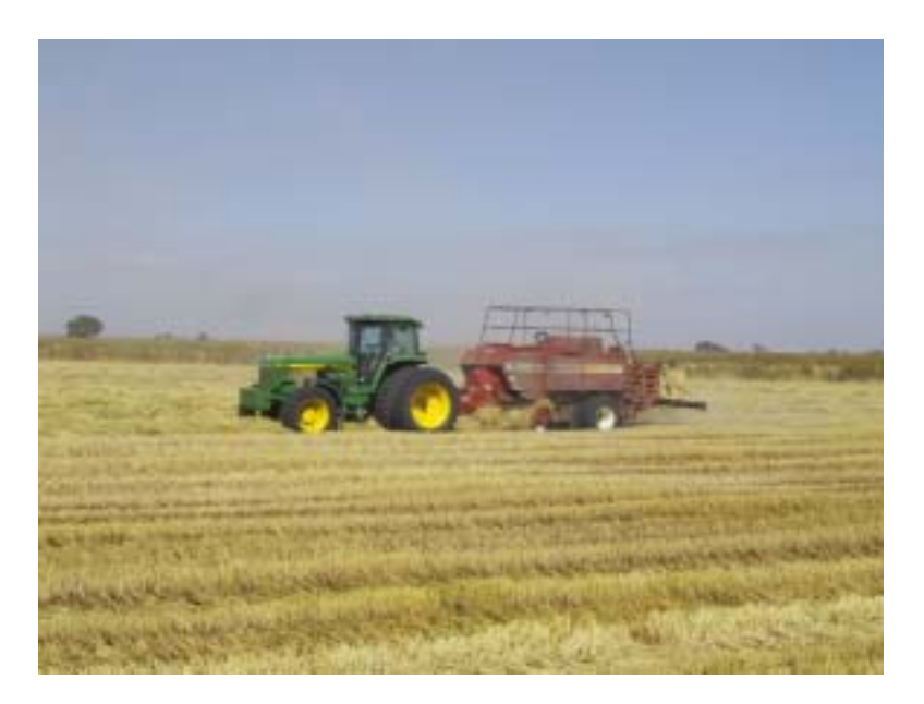
Figure 4-5. Baling rice straw utilizing a large bale baler.

Figure 4-5 shows a Hesston large bale baler making 36 "x48"x96" bales weighing from 975 to 1025 pounds, with 11 - 15% moisture contents.