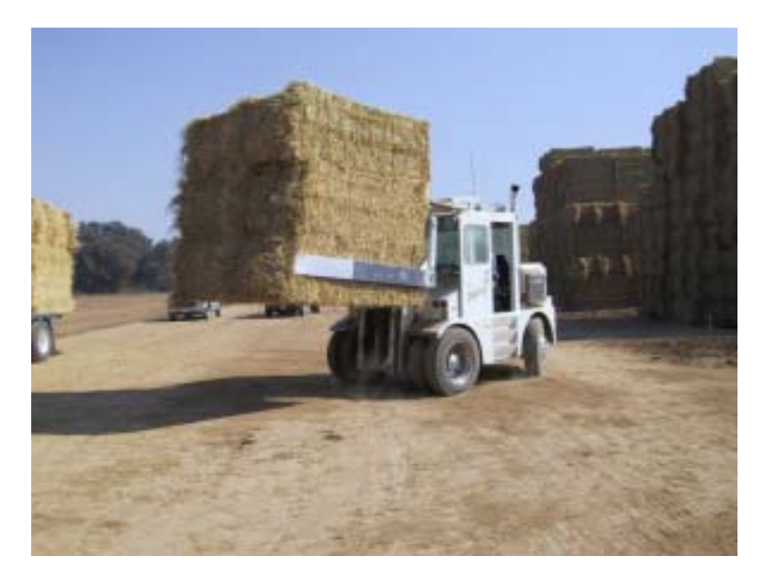
Figure 4-9. A squeeze loading rice straw for transportation to a user.

The following Figure 4-9 shows the loading of a truck for transportation to the facility. This equipment, commonly know as a squeeze, can efficiently load and unload rice straw and stack bales for storage.