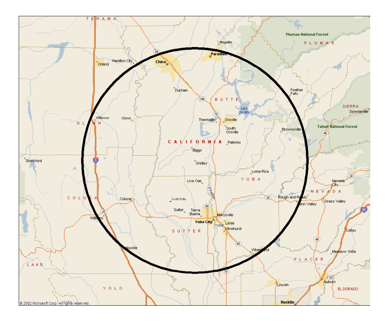
Figure 4-2. Map depicting a 30-mile radius feedstock supply area surrounding Gridley.