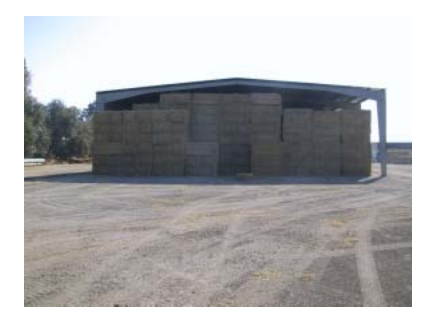
Figure 4-13. Rice straw stored in a barn on grower's property.

The following Figure 4-13 shows rice straw stored in a barn. This type of storage is recommended for longer-term storage (more than one year). The initial cost of a barn is approximately $50/BDT for a barn that will store approximately 2,000 BDT. In this case, the cost is approximately $7/BDT on an annual basis. Barn storage provides the best protection for rice straw, eliminating losses due to water entering the stack either when tarps become separated during bad weather or when water seeps up from the bottom of a stack.