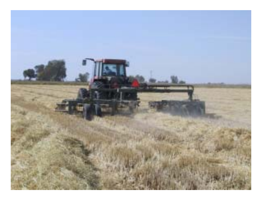
Figure 4-4. Raking rice straw in preparation for baling.