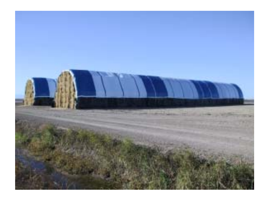
Figure 4-12. Tarped rice straw in storage on growers site.

The following Figure 4-12 shows tarped rice straw stored on a rice grower's property. Tarping is effective for short-term storage. Tarping costs range between $5 - $8/BDT depending upon how extensively the stacks are covered.