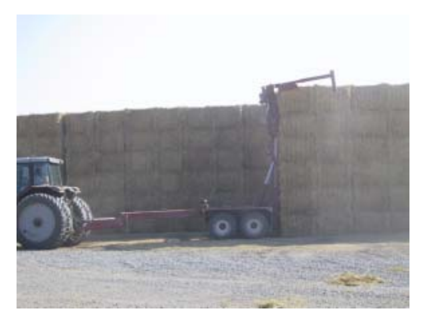
Figure 4-8. Stacking large bales at a grower's roadside site.

The following Figure 4-8. shows rice straw bales stored at a roadside location, awaiting transport to a user.