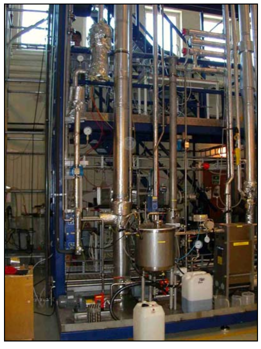
Figure 1 SINTEF Low Pressure Pilot Unit – Lower Half