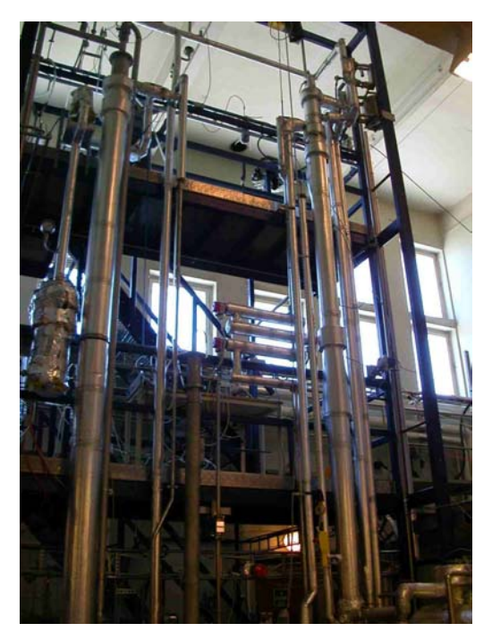
Figure 2 SINTEF Low Pressure Pilot Unit – Upper Half