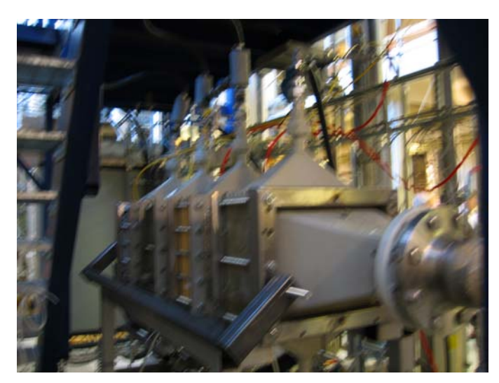
Figure 4 SINTEF Low Pressure Pilot Unit -- Gas/Liquid Membrane Contactor Housing