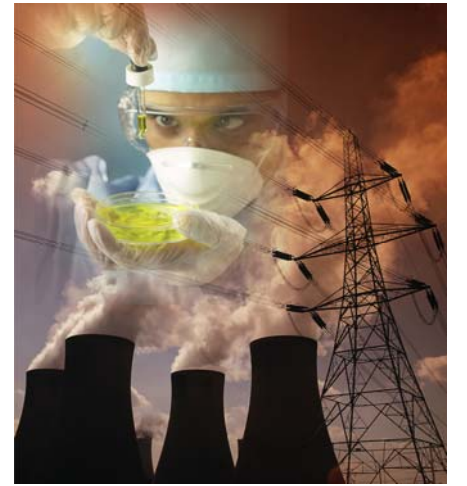
The role of catalysis on intensifying reactions and producing desired products, while minimizing waste, cannot be underestimated.

Catalyst materials and technologies are vital to current and future efforts to 1) reduce our need for imported energy resources by developing new energy production processes and better methods for using domestic resources; 2) develop new energy-efficient and environmentally benign chemical production processes; and 3) develop new emission reduction technologies. A grand challenge of chemistry is to understand how chemical reactions, i.e., the making and breaking of chemical bonds, occur so that reactions can be controlled to make any desired molecule at practical, meaningful rates. Numerous practical targets can serve to motivate basic research. Among them are alkane oxidation, hydrogen production from water (including photocatalytic approaches), production of fuels from biomass via chemical and biocatalytic approaches, nitrogen oxide emission control, molecular catalysts for advanced polymer materials, carbon dioxide fixation and sequestration, and viable alternatives for expensive precious metal catalysts. Breakthroughs, rather than incremental improvements, are needed in many of these complex systems areas—breakthroughs that a national center can facilitate in a basic research