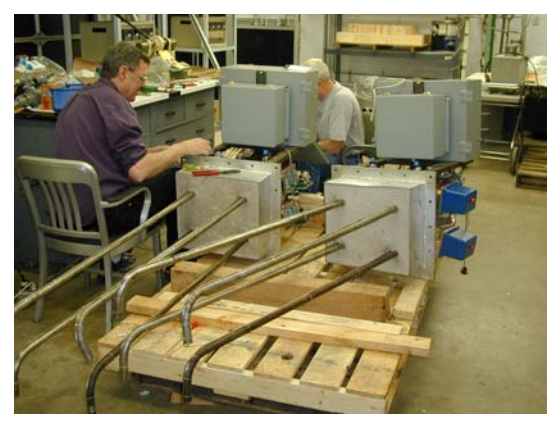
Figure 1. Air heater tube testing assemblies during final installation of instruments and controls