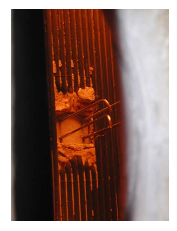
Figure 3. Air heater tube testing assembly installed in the upper