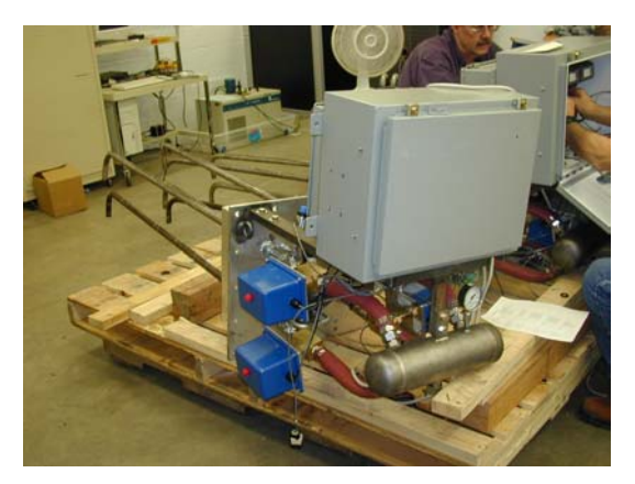
Figure 2. Furnace-side view of air heater tube testing assemblies