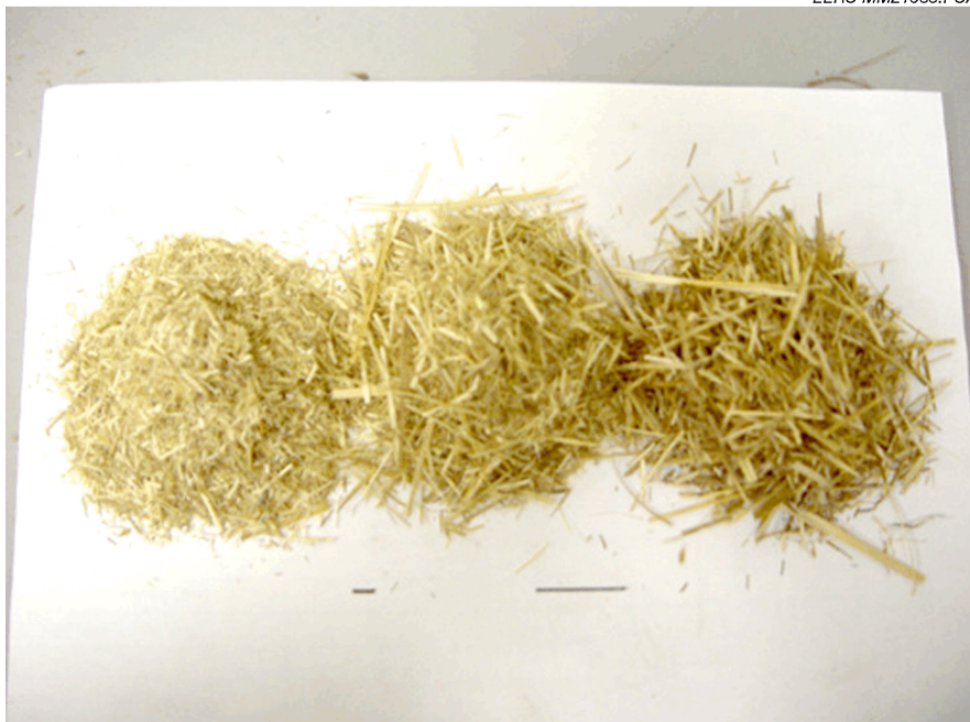
Figure F4. Switchgrass hammer-milled with 1/4-inch, 1/2-inch, and 1-inch screens.