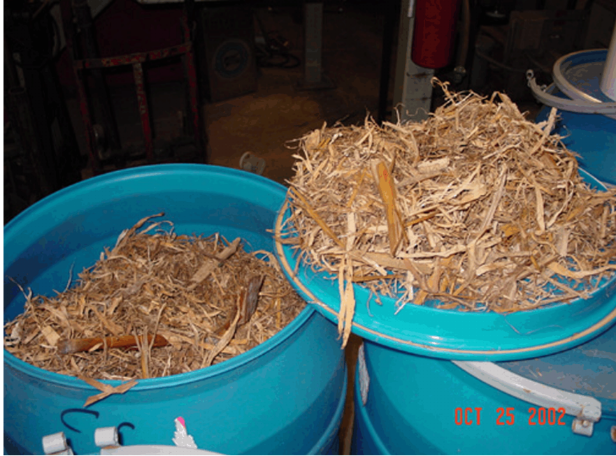
Figure F1. Corn stover.