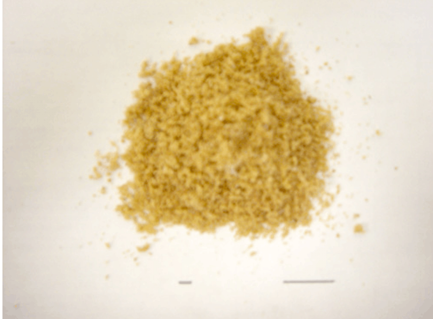
Figure F9. Wet sawdust.