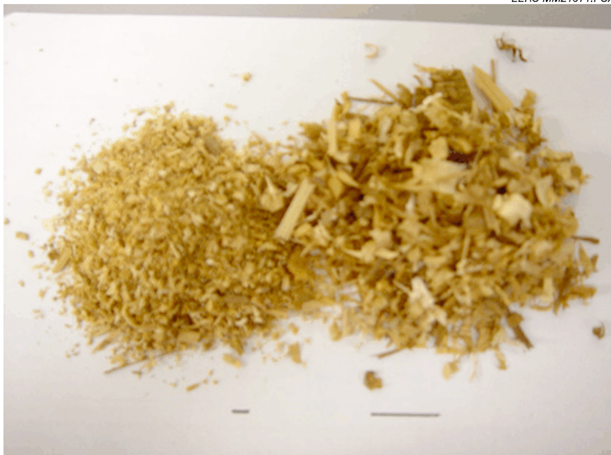
Figure F8. Cedar sawdust and cedar molder shavings.