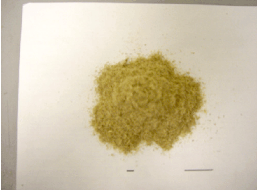
Figure F7. E-grass hammer-milled with 1/8-inch screen.