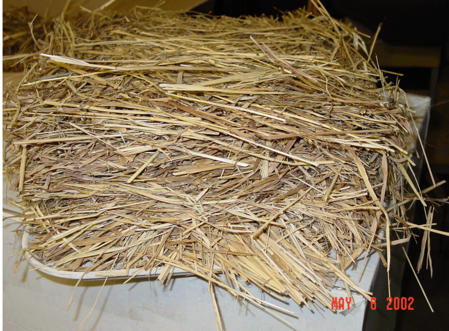
Figure F3. Switchgrass.