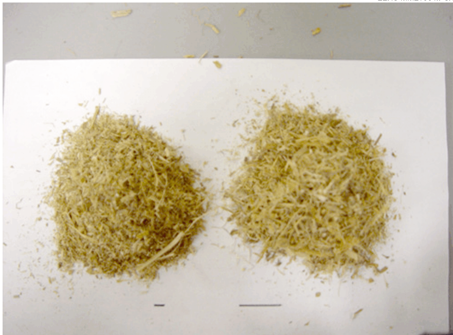
Figure F2. Corn stover hammer-milled with \frac{1}{4} -inch and \frac{1}{2} -inch screens (note: left line below biomass is \frac{1}{4} -inch in length; right line below biomass is 1-inch in length).