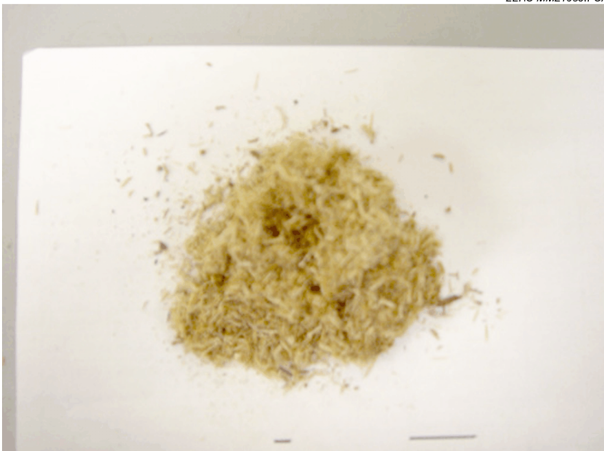
Figure F6. Urban wood waste hammer-milled with 1/4-inch screen.