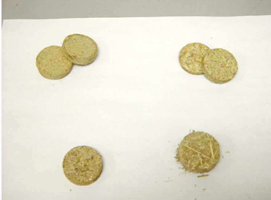
Figure F11. Biomass pellets – clockwise from top right: corn stover, switchgrass, urban wood waste, and E-grass.