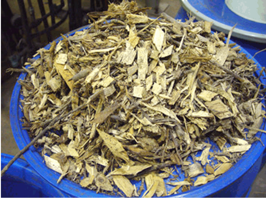
Figure F5. Urban wood waste.